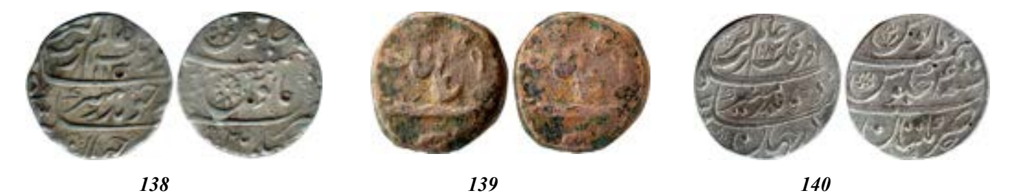
138 Aurangzeb, Silver Rupee, 11.4 gm, Machhalipatan Mint, RY 44, AH 1122, With a lotus flower in Sim of manus on reverse centre. VF. Rare. Estimate: ₹ 2,000-2,500

139 Aurangzeb, Mailapur Mint, Copper, 6.09 g, ½ Dam – Paisa, Alamgir legend on obverse. Mint name Mailapur at top on reverse. Very Fine, Rare. Estimate: ₹ 6,000-8,000